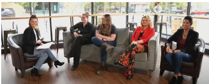
Women in Manufacturing Panel

Watch the 2022 MFG Day Video on YouTube at: https://youtu.be/OGqpgZ-aEFc