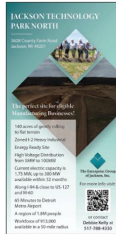
Jackson Magazine Advertisement